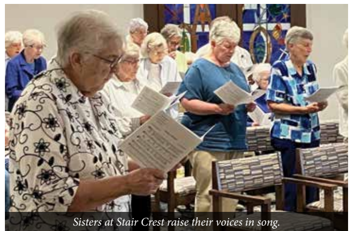
Sisters at Stair Crest raise their voices in song.

When our Sisters gather to pray and sing, we make a joyful sound. We value liturgy done well and put our energies, whatever they may be at this time in our lives, at the service of our prayer together. Personal prayer and small group prayer happen around the complex. And we've been able to carve out a prayer time in the busy Stair Crest daily calendar for all of us to come together at least once a day. That common prayer came together when we established a flexible structure that used the gifts of any willing Sisters and residents.